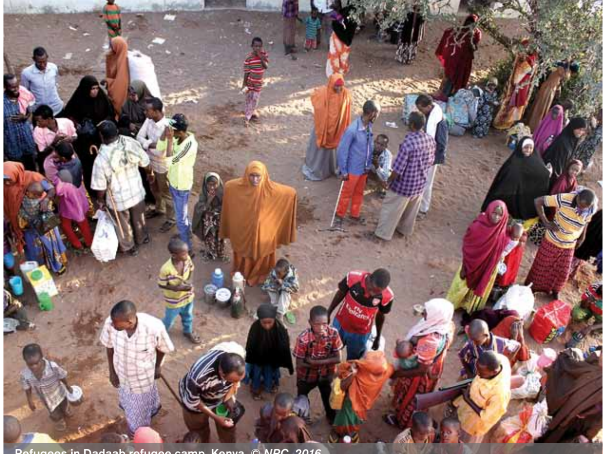
efugees in Dadaab refugee camp, Kenya.

against harassment. One South Sudanese women told us simply, "we feel much safer with the documents."54