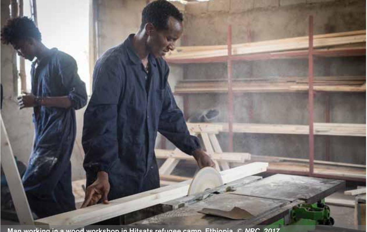
Man working in a wood workshop in Hitsats refugee camp, Ethiopia.