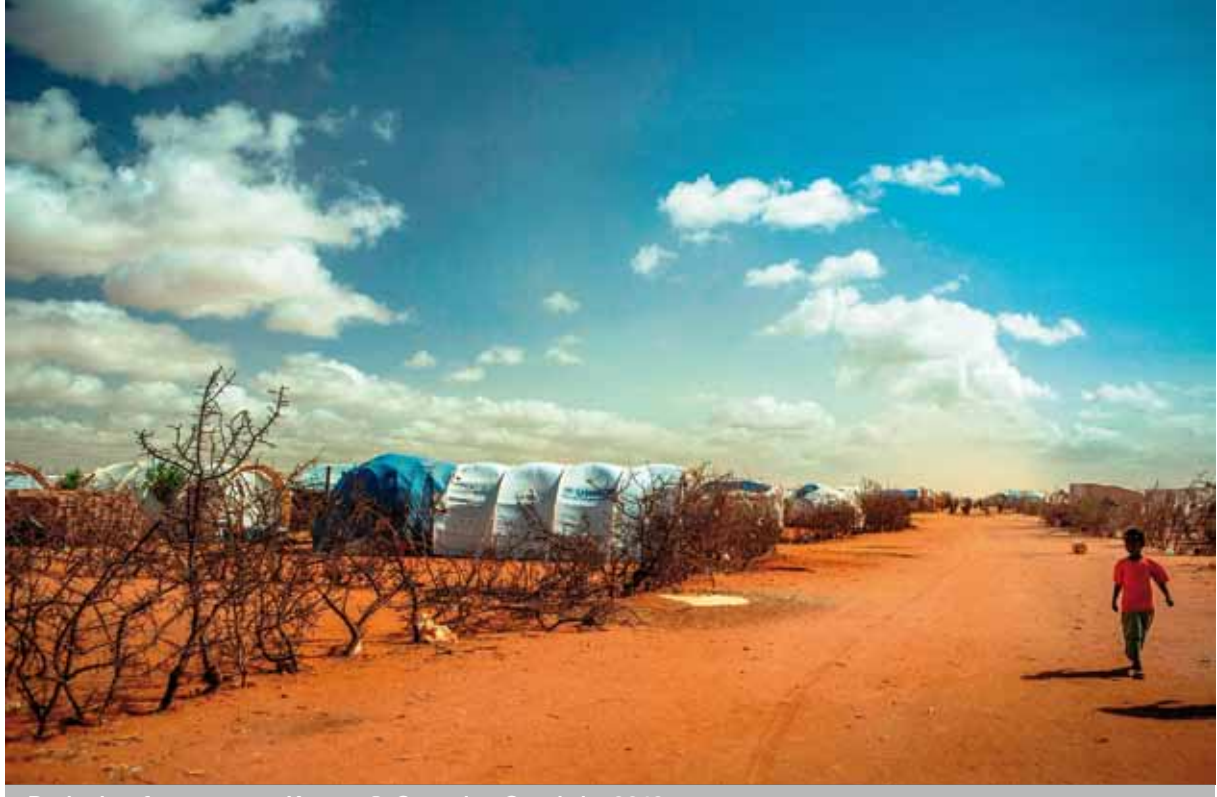
Dadaab refugee camp, Kenya.

identity documents are conduits of the ability to exercise certain rights and freedoms, many refugees expressed perceptions that the curtailment of their rights was represented in their refugee ID, and that they needed a different ID – one that allowed them to exercise their basic humanity.